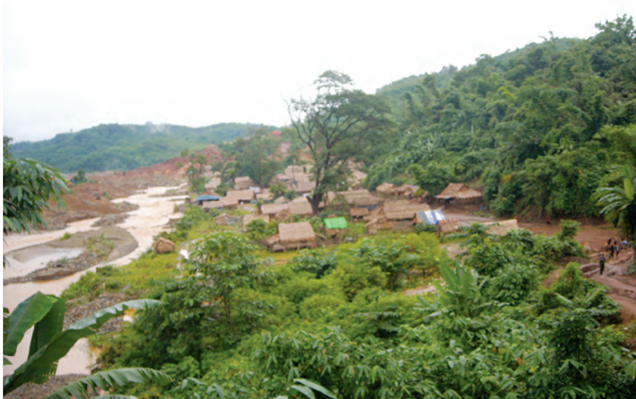
The above photo was taken on July 15 th 2012 in Papun District, and shows the damage that resulted from gold mining near the Baw Paw Law River. According to the community member who took these photos, many villagers' houses were damaged during the operation.

The ultimate aim of any land-governance reforms should be to protect the property rights of people in Myanmar, while providing an environment that allows for sustainable economic development for their benefit. Communities are best placed to make decisions about local development in accordance with their priorities and needs, including handling dispute resolution and managing resource revenue for the benefit of the community. Domestic legal standards are necessary, but they will be inadequate if the protection they purport to provide is inaccessible, inappropriate to affected communities or flouted in practice. The more opportunities at the local, national and international levels for villagers in eastern Myanmar to respond to unjust land practices, the greater the chance that such issues will be addressed and practices reformed for the benefit of all actors involved.