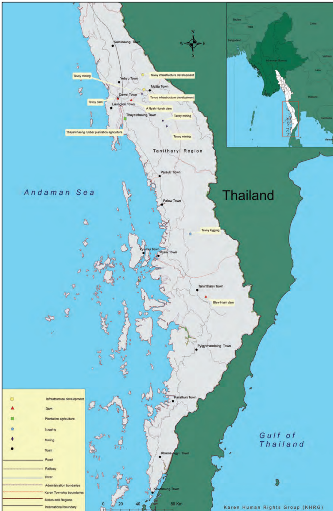
Figure 2: Projects under observation in locally-defined Karen districts (Tanintharyi Region)