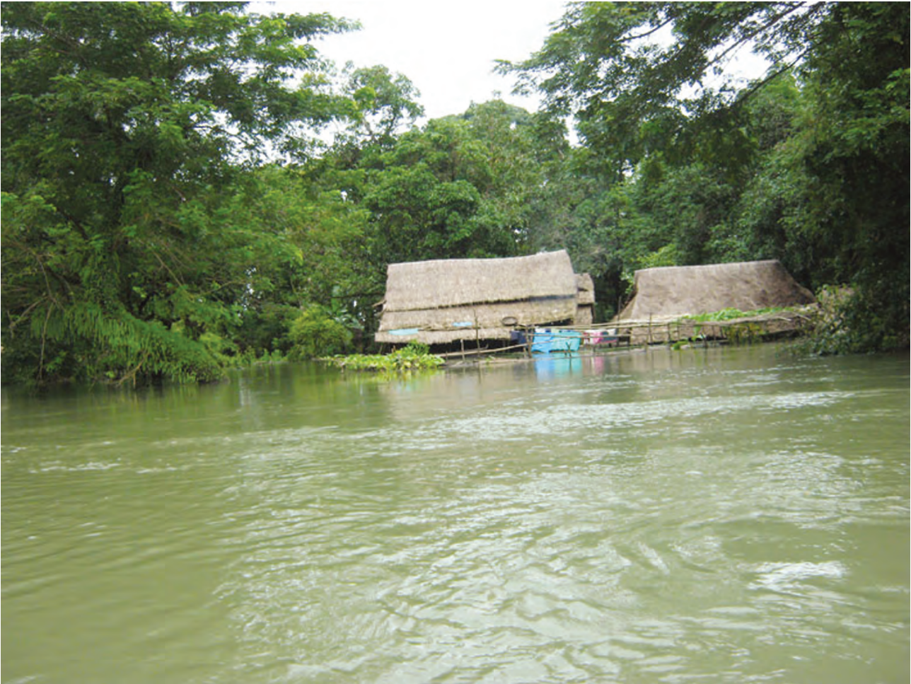
The above photo was taken on August 9 th 2012 and shows the flooding of villagers' homes in Let Kauk Wa village, Nyaunglebin District. The community member who took these photos reports that the flooding was caused by the Shwegyin Dam.